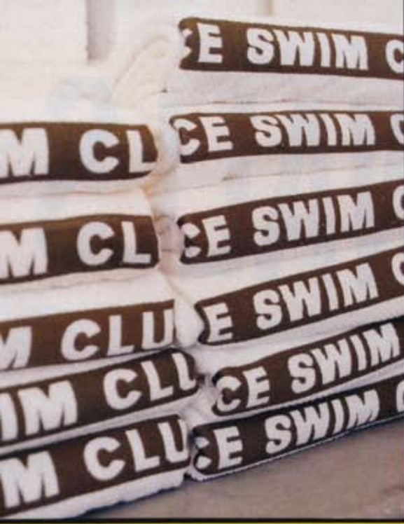
California Casual Clockwise from above: Towels by the pool at the Ace Hotel & Swim Club; ceramist Stan Bitters's igloo-shaped fireplace in a ground-floor room; the hotel lobby; taking the hotel's free bikes out for a spin around town.