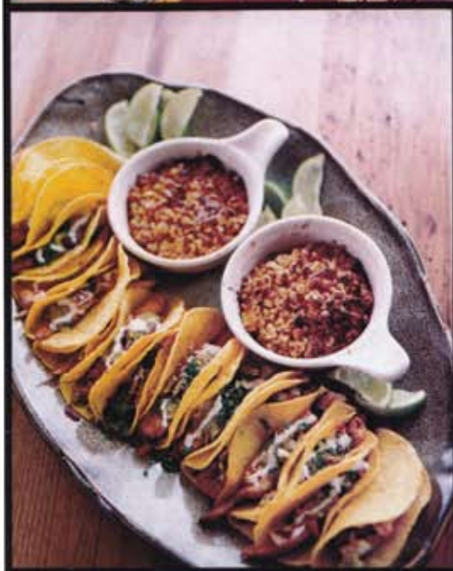
Palm Springs Escape Clockwise from above: A macramé installation by artist Michael Schmidt in the Ace’s lobby; ping-pong on the patio; a mobile bar, housed in a vintage camper; hammocks by the pool; a turntable in a guest room; one of the hotel’s two pools; fish tacos with a side of baked corn from the property’s King’s Highway restaurant.