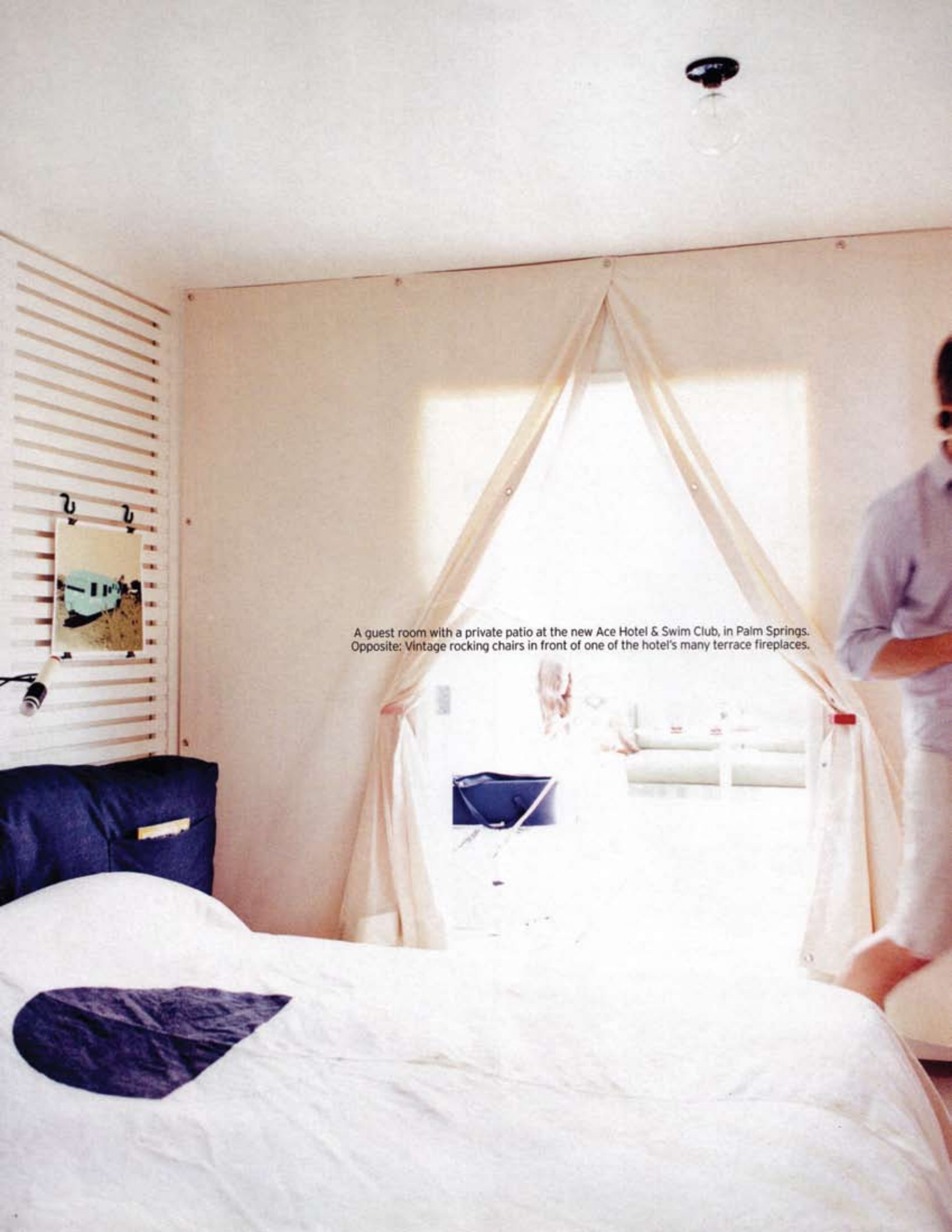
A guest room with a private patio at the new Ace Hotel & Swim Club, in Palm Springs. Opposite: Vintage rocking chairs in front of one of the hotel's many terrace fireplaces.